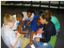
Discovery students preparing for Destination Imagination.

The Discovery program is guided by the principle that the unique characteristics exhibited by gifted children drive the need for a program that is intellectually challenging, emotionally accepting, and